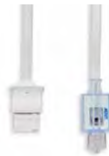
Non-Winged Housing with 12" (30cm) cable