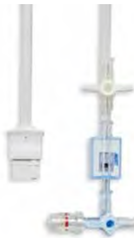
Non-Winged Housing and 3-Way Stopcock with Rotating Male Adapter and 1-Way Stopcock with 48" (122cm) cable