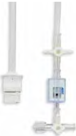
Non-Winged Housing and 3-Way and 1-Way Stopcocks with 48" (122cm) cable