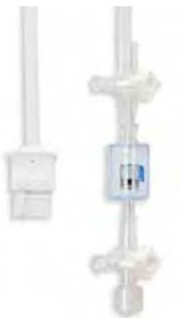
Non-Winged Housing and 3-Way Stopcock bonded to both ends with 48" (122cm) cable