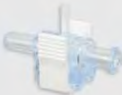
Adult 3cc/hr flow rate. White