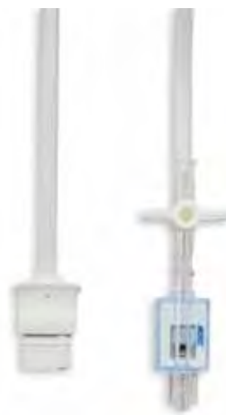
Non-Winged Housing and Bonded 1-Way Stopcock with 48" (122cm) cable