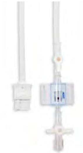
Winged Housing and Two Bonded 1-Way Stopcocks with 12" (30cm) cable