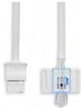
Winged Housing with 12" (30cm) cable