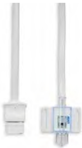
Winged Housing with 48" (122cm) cable