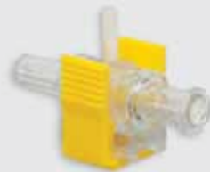
Pediatric 30cc/hr flow rate. Yellow