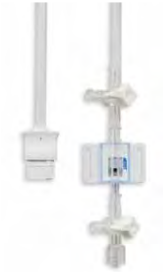
Winged Housing and Two Bonded 3-Way Stopcocks with 12" (30cm) cable