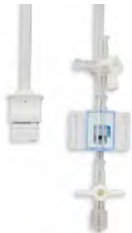
Winged Housing and Bonded 3-Way and 1-Way Stopcocks with 12" (30cm) cable