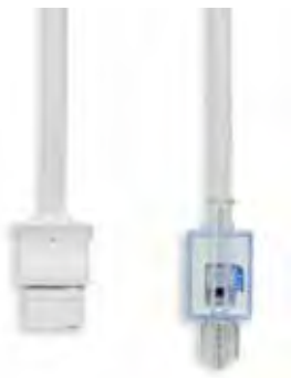
Non-Winged Housing with 48" (122cm) cable