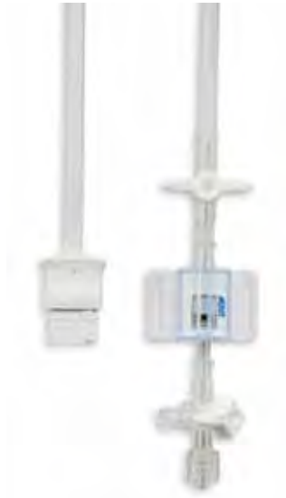
Winged Housing and Bonded 1-Way and 3-Way Stopcocks with 12" (30cm) cable