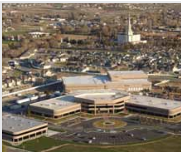
Corporate Headquarters, South Jordan, Utah