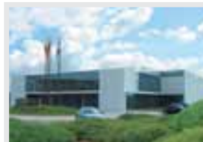
European Headquarters Maastricht, The Netherlands