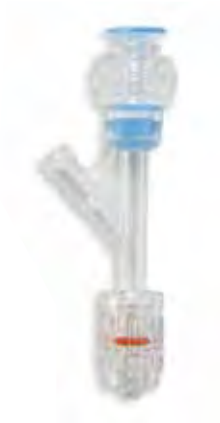
Large Bore Dual Seal Hemostasis Valve 500981002

Material: Polycarbonate Inner Lumen: 9F (.118") Valve Material: Silicone Luer: Rotating