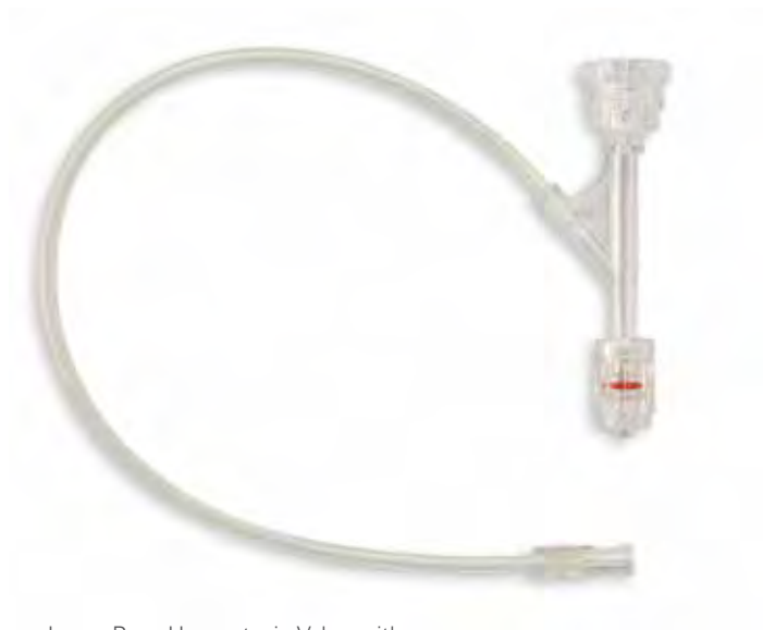
Large Bore Hemostasis Valve with 12" Polyurethane Tubing Extension