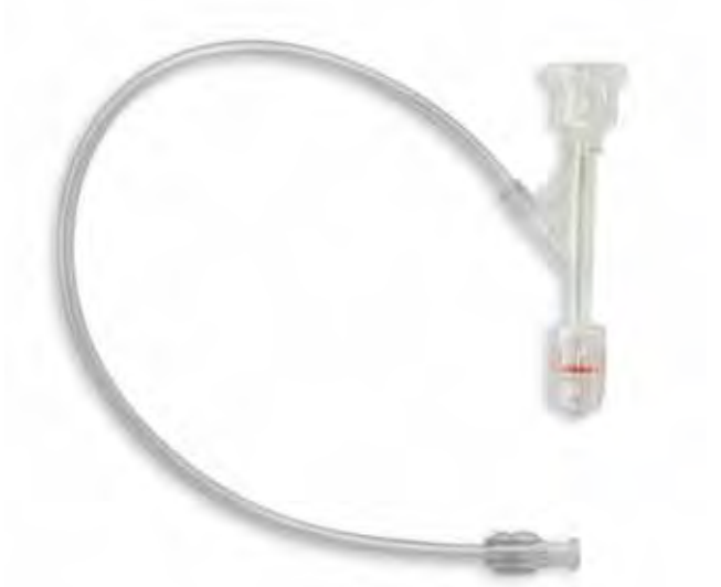
Large Bore Hemostasis Valve with 12" PVC Tubing Extension