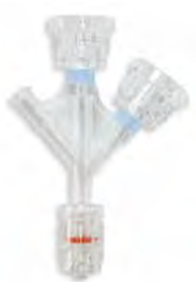
Large Bore Double Y Hemostasis Valve Inner Lumen: 9F (.120") 501075001

Material: Polycarbonate Valve Material: Silicone Luer: Rotating