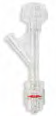
Passage® Hemostasis Valve with Rotating Luer 500066

Material: Polycarbonate Valve Material: Silicone