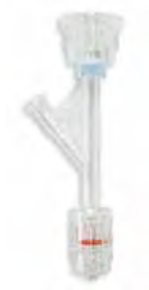
Large Bore Hemostasis Valve 500628002

Material: Polycarbonate Inner Lumen: 9F (.120") Valve Material: Silicone Luer: Rotating