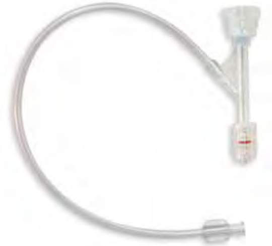
Large Bore Hemostasis Valve with 12" PVC Tubing Extension 563010001