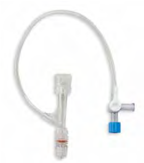
Hemostasis Valve with 8" Tubing Extension MAP350