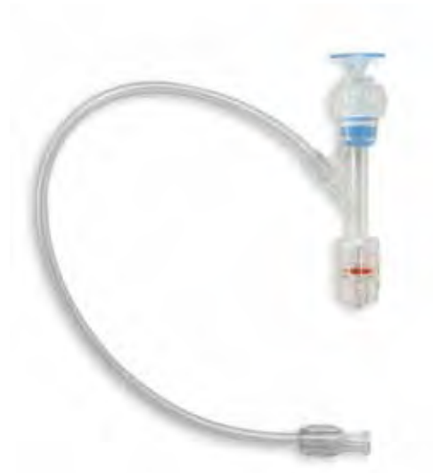
Hemostasis Valve with 10" PVC Tubing Extension 501086001