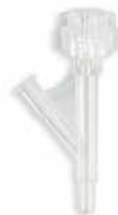
Hemostasis Valve with Slip Fit (.179" to .209" taper) Inner Lumen: 7.5F (.097") K12-00457P