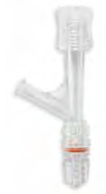
Hemostasis Valve 580195001

Material: Polycarbonate Inner Lumen: 7F (.094") Valve Material: Silicone Luer: Rotating