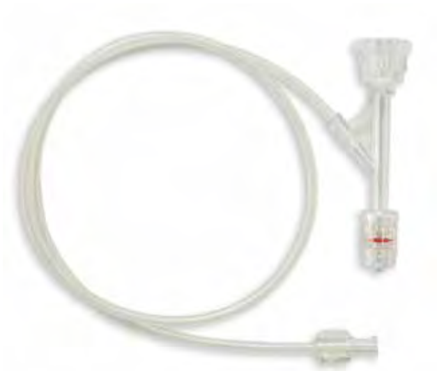
Large Bore Hemostasis Valve with 24" Polyurethane Tubing Extension