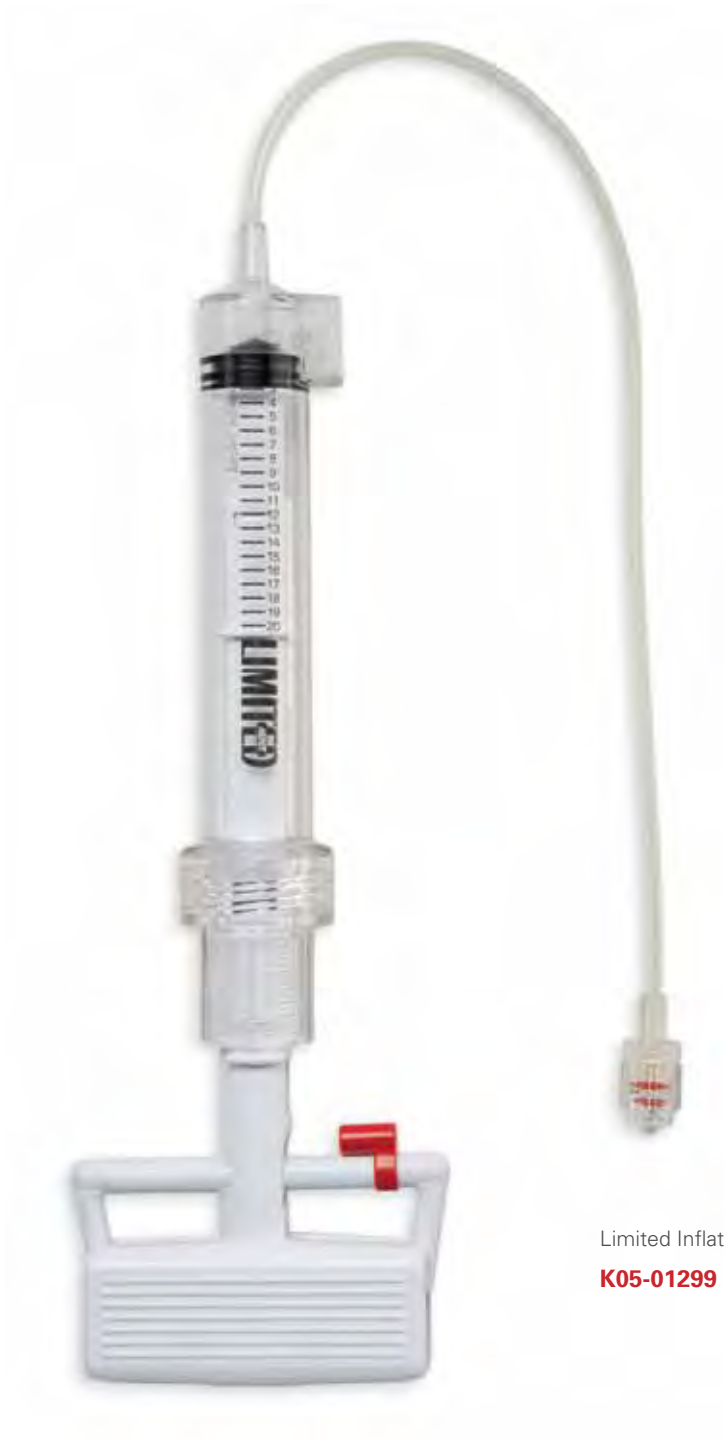
Limited Inflation Device