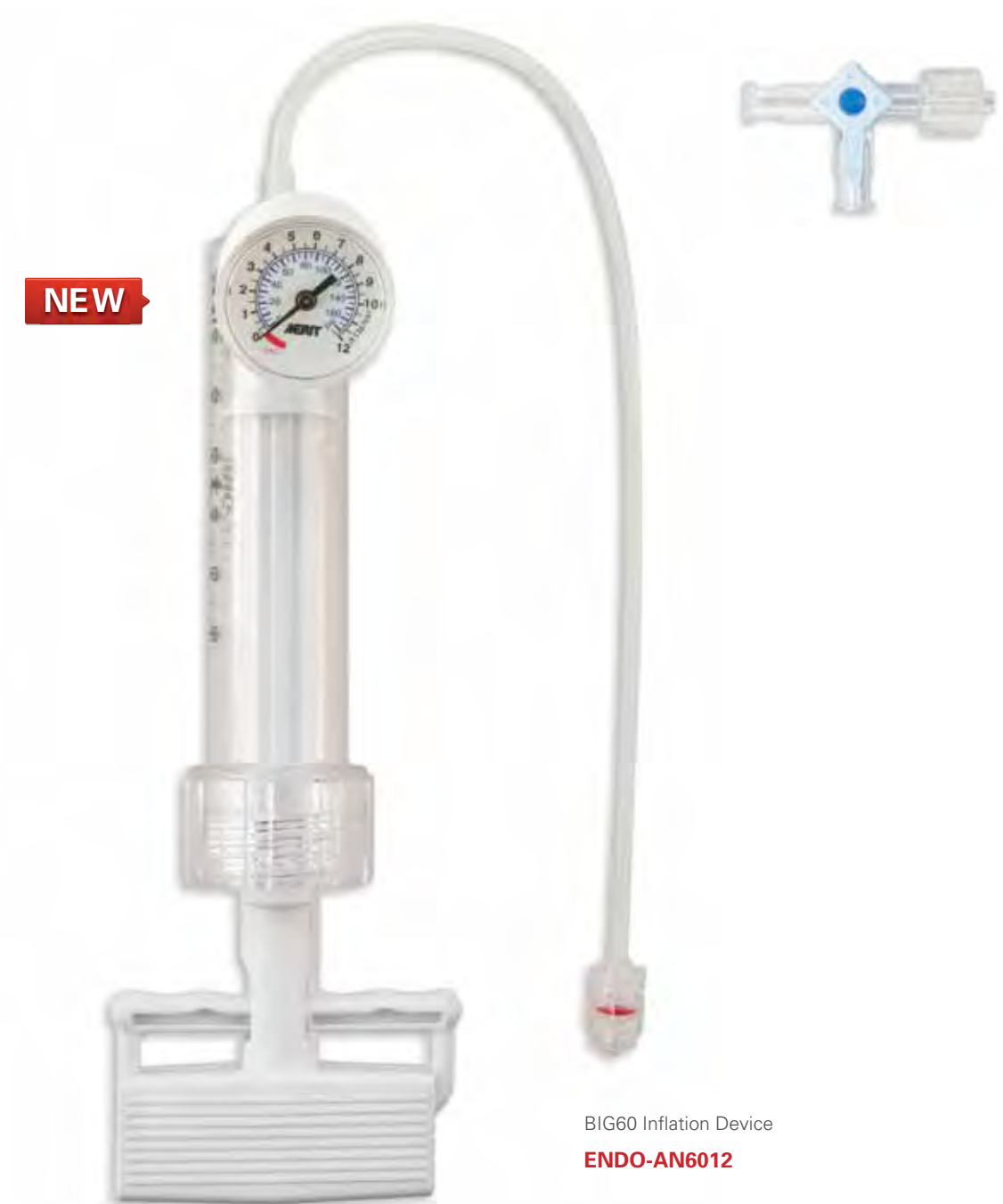
BIG60 Inflation Device