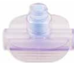
T-Port 6.8mm ID Valve Adaptor 702236001