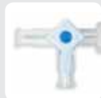
Stopcocks Page 199