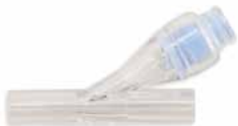
Y-Port 4.0mm, Copolyester 702239001