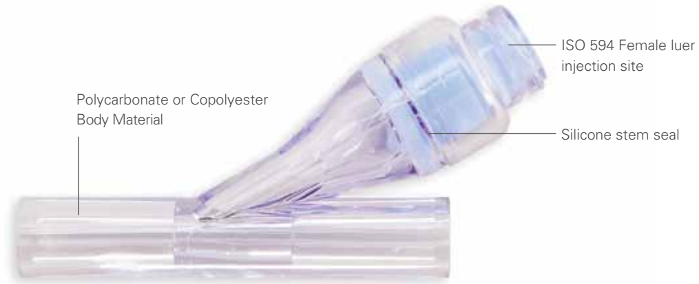
Y-Port 4.0mm, PC 702238001