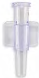
Gamma Color Female Luer Lock Slip Fit .154 to .192 Taper