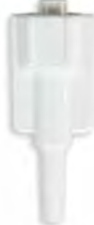
White Male Luer Lock Slip Fit .120 to .150 Taper 100914001