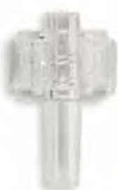
Clear Male Luer Lock, Slip Fit, .148 to .166 102056001