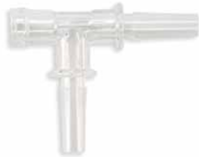
Clear One Female Luer Lock, Two Male Slip