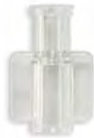
Clear Female Luer Lock Tubing Pocket .182 to .192