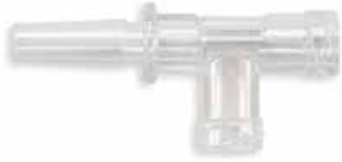
Clear Two Female Luer Lock, One Male Slip