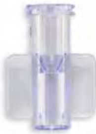
Gamma Color Female Luer Lock Tubing Pocket .118 to .124