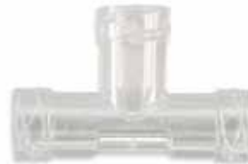
Clear All Female Luer Lock