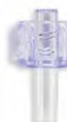
Gamma Color Male Luer Lock Slip Fit .178 to .208 102039002