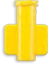
Yellow Female Luer Lock Tubing Pocket .118 to .124