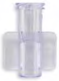
Gamma Color Female Luer Lock Tubing Pocket .095 to .101