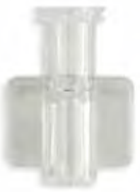
Clear Female Luer Lock Tubing Pocket .124 to .132