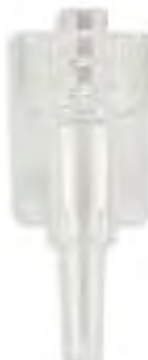
Clear Male Luer Lock Slip Fit .120 to .150 Taper 102110001