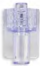
Gamma Color Male Luer Lock Tubing Pocket .118 to .124