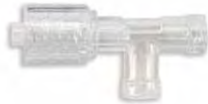
Clear Two Female Luer Lock, One Male Swivel