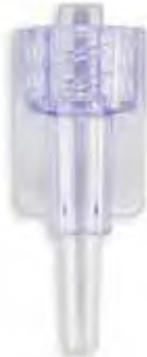
Gamma Color Male Luer Lock Slip Fit .120 to .150 Taper 102200002