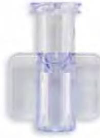
Gamma Color Female Luer Lock Tubing Pocket .124 to .132