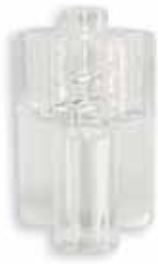
Clear Male Luer Lock Tubing Pocket .095 to .101