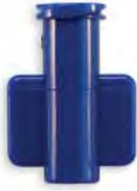
Royal Blue Female Luer Lock Tubing Pocket .095 to .101