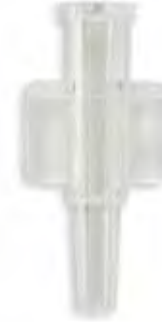
Clear Female Luer Lock Slip Fit .154 to .192 Taper