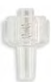
Clear Male Luer Lock Slip Fit .178 to .208 102039