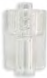
Clear Male Luer Lock Tubing Pocket .140 to .145