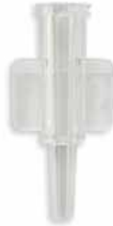
Clear Female Luer Lock Slip Fit .120 to .150 Taper