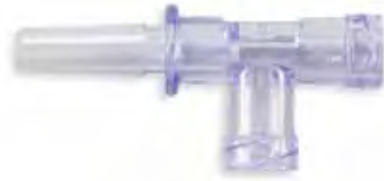
Gamma Color Two Female Luer Lock, One Male Slip