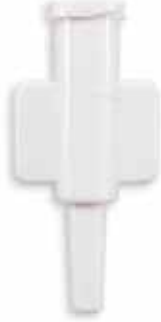
White Female Luer Lock Slip Fit .120 to .150