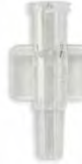
Clear Female Luer Lock Slip Fit .179 to .209