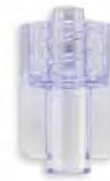
Gamma Color Male Luer Lock Tubing Pocket .158 to .164