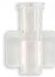
Clear Female Luer Lock Tubing Pocket .158 to .164