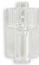
Clear Male Luer Lock Tubing Pocket .118 to .124