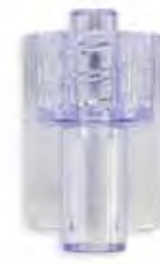
Gamma Color Male Luer Lock Tubing Pocket .095 to .101