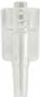
Clear Male Luer Lock Slip Fit .154 to .192 102100001