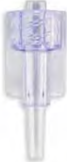
Gamma Color Male Luer Lock with Slip Fit .154 to .192 102200001