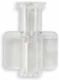
Clear Female Luer Lock Tubing Pocket .095 to .101