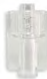
Clear Male Luer Lock Tubing Pocket .182 to .192