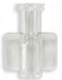
Clear Female Luer Lock Tubing Pocket .124 to .132