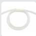
Tubing Page 191