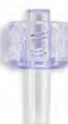
Gamma Color, Male Luer Lock Slip Fit, .148 to .166 102056002