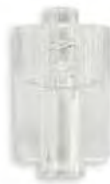
Clear Male Luer Lock Tubing Pocket .108 to .114