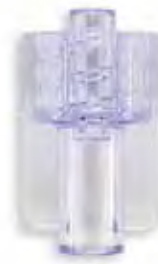
Gamma Color Male Luer Lock Tubing Pocket .124 to .132