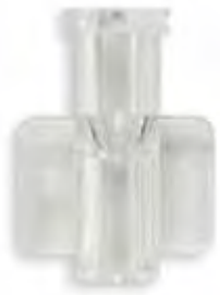
Clear Female Luer Lock Tubing Pocket .140 to .145