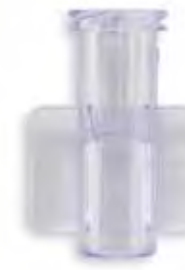
Gamma Color Female Luer Lock Tubing Pocket .140 to .145