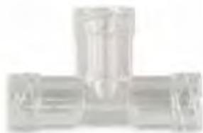
Clear with 0.139" Tubing Pockets