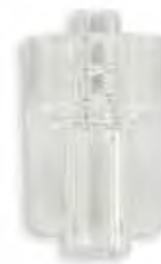
Clear Male Luer Lock Tubing Pocket .124 to .132