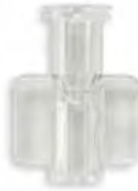
Clear Female Luer Lock Tubing Pocket .118 to .124