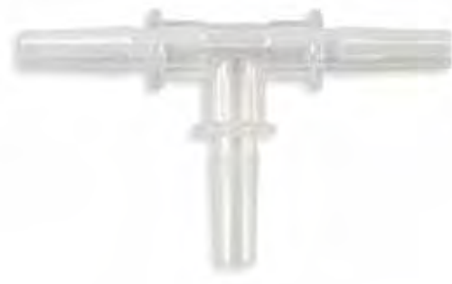
Clear All Male Slip