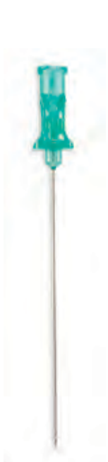
21 Gauge, Thin Wall, 7.0cm Length Echo Tip