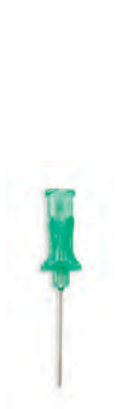
21 Gauge, Thin Wall, 2.5cm Length

Hub: Polycarbonate Cannula/Obturator: Stainless Steel