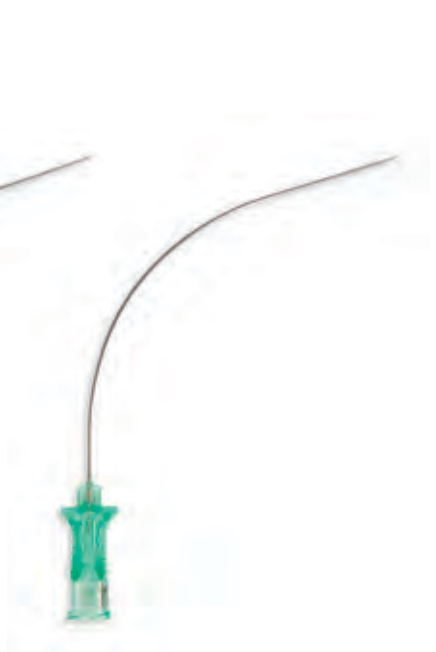
21 Gauge Curved Needle, 9.0cm Length with Echo Tip