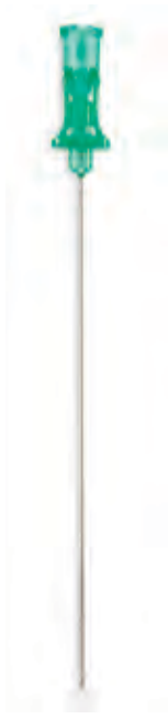
21 Gauge, Thin Wall, 9.0cm Length Echo Tip