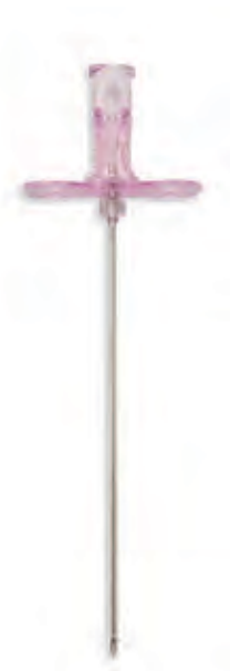
18 Gauge Needle, Thin Wall, 7cm Length with Courmand Shield AD18T71WCP