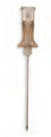
19 Gauge Needle, Ultra Thin Wall, 4.0cm Length