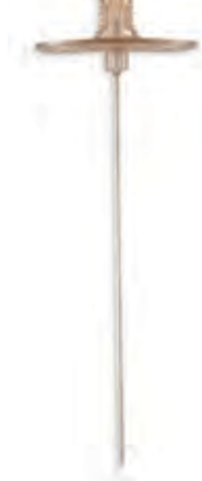
19 Gauge Needle, Thin Wall, 5cm Length with Seldinger Shield