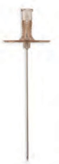
19 Gauge Needle, Ultra Thin Wall, 7.0cm Length with Courmand Shield