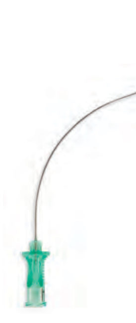
21 Gauge Curved Needle, 9.0cm Length