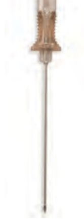
19 Gauge Needle, Ultra Thin Wall, 5.1cm Length