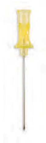
20 Gauge Needle, Thin Wall, 4.0cm Length

Hub: Polycarbonate Cannula/Obturator: Stainless Steel