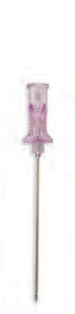
18 Gauge Needle, Thin Wall, 5.1cm Length AD18T51WP

Hub: Polycarbonate Cannula/Obturator: Stainless Steel