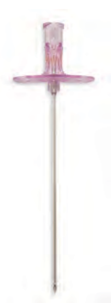
18 Gauge Needle, Thin Wall, 7cm Length with Seldinger Shield AD18T71WSP