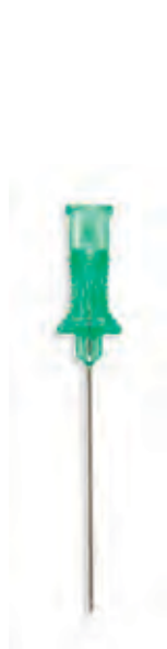
21 Gauge, Thin Wall, 4.0cm Length