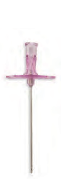
18 Gauge Needle, Thin Wall, 5cm Length with Seldinger Shield AD18T51WSP