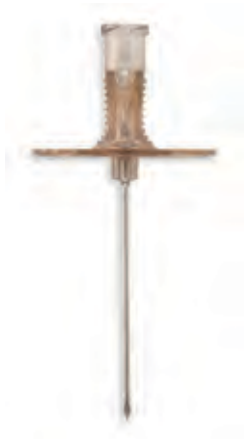
19 Gauge Needle, Ultra Thin Wall, 4.0cm Length with Courmand Shield

Hub: Polycarbonate Cannula/Obturator: Stainless Steel