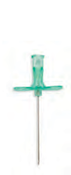
21 Gauge, Thin Wall, 4.0cm Length