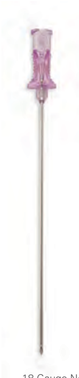
18 Gauge Needle, Normal Wall, 9.0cm Length AD18N91WP