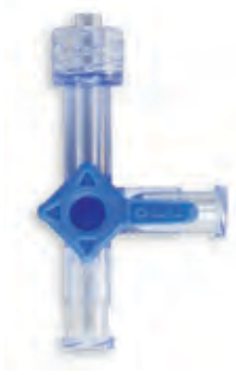
Fixed Male Luer H3FLP