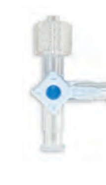
Swivel Nut M3SNP