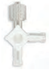
200 PSI, Swivel Nut S4SNP