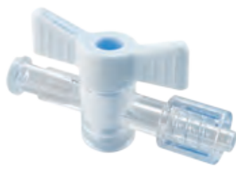
Swivel Nut M1SNP