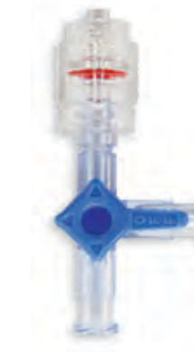
Right Rotating Male Luer H3RRP