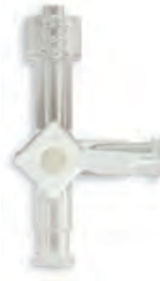
200 PSI, Fixed Male Luer S4FLP