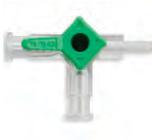
Barbed Connector, Green Handle 501641006