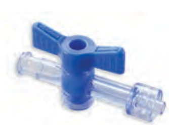
Fixed Male Luer H1FLP