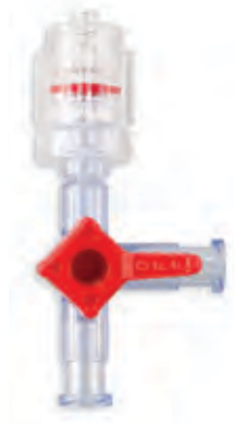
Right Rotating Male Luer U3RRP