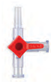
Slip Luer U3SLP