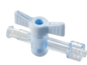
Fixed Male Luer M1FLP