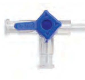
Barbed Connector, Blue Handle 501641008