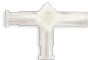
With Tubing Pocket .110 501855001