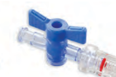
Right Rotating Male Luer H1RP