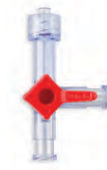
Fixed Male Luer U3FLP