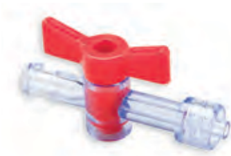
Fixed Male Luer U1FLP