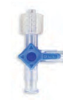
Swivel Nut H3SNP