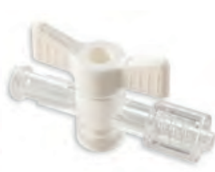
Swivel Nut S1SNP