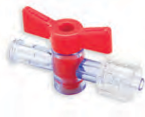
Swivel Nut U1SNP