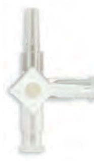
200 PSI, Slip Luer S4SLP