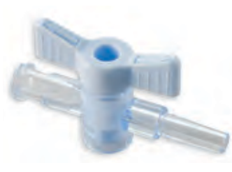
Slip Luer M1SLP