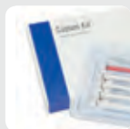
Custom Kits Page 141