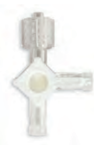
Swivel Nut, Large Bore L3SNP