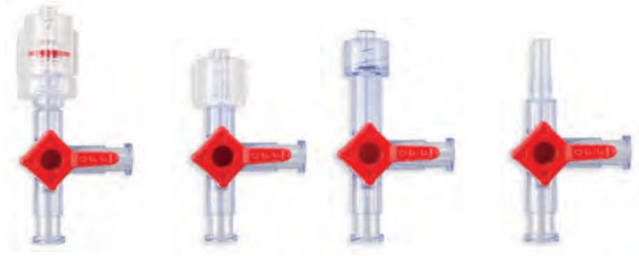
Right Rotating Male Luer U4RRP