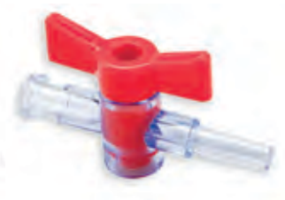
Slip Luer U1SLP