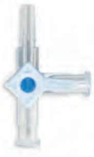
Slip Luer M3SLP