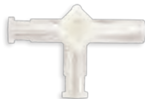
With Tubing Pocket .158 501868001