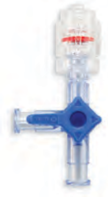
Left Rotating Male Luer H3RLP