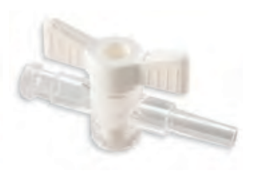
Slip Luer S1SLP