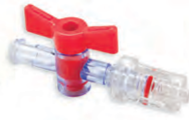
Right Rotating Male Luer U1RP