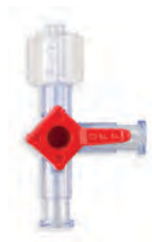
Swivel Nut U3SNP