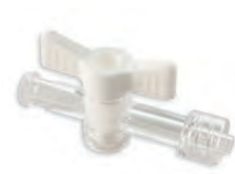
Fixed Male Luer S1FLP