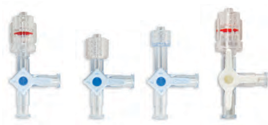
Right Rotating Male Luer M4RRP