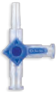
Slip Luer H3SLP