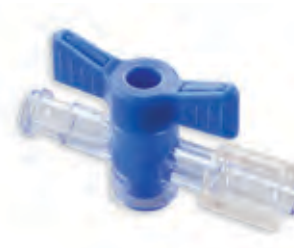
Swivel Nut H1SNP