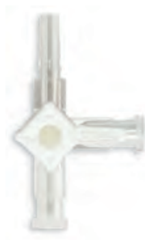
Slip Luer S3SLP