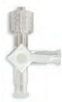
Swivel Nut S3SNP