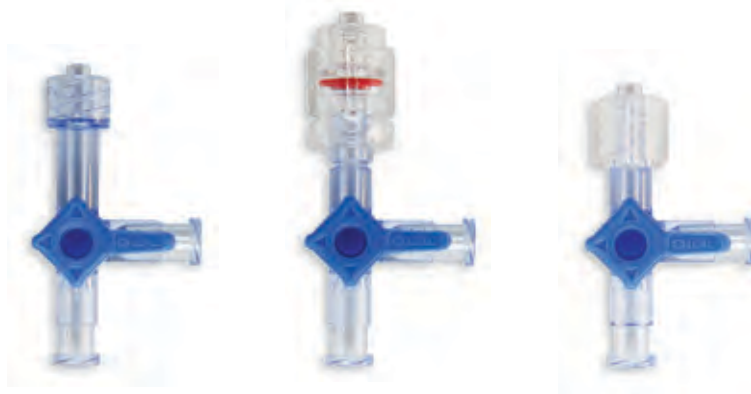
Fixed Male Luer H4FLP