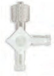
50 PSI, Swivel Nut, Large Bore L4SNP