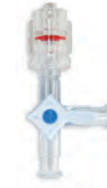
Right Rotating Male Luer M3RRP