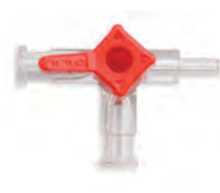
Barbed Connector, Red Handle 501641004