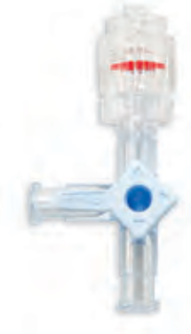
Left Rotating Male Luer M3RLP