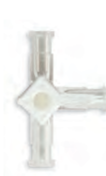
All Female Luer S3FP