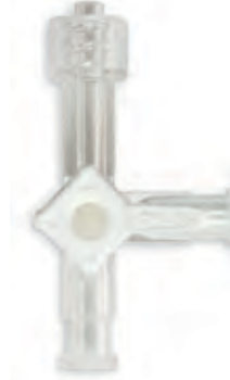
Fixed Male Luer S3FLP