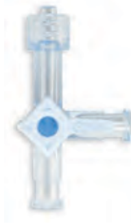
Fixed Male Luer M3FLP