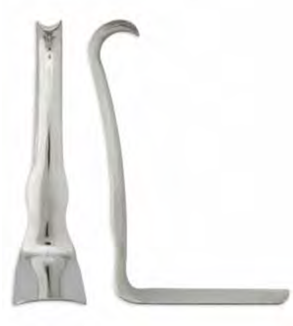
Eastman Med Qty/Case: 80 M-MR051