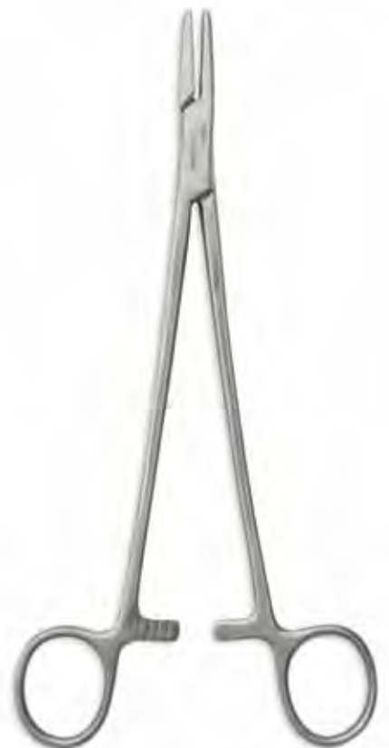
Mayo Hegar 10" Qty/Case: 250