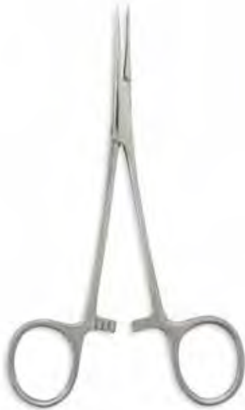
Mosquito, Straight, FP 5" Qty/Case: 250