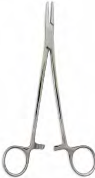
Mayo Hegar 7" Qty/Case: 100