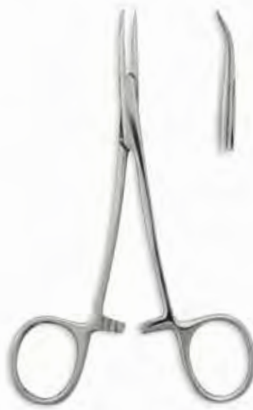
Mosquito, Curved, 5" FP/Large Rings Qty/Case: 250