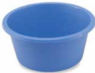
Utility Bowl 16 oz, 500cc