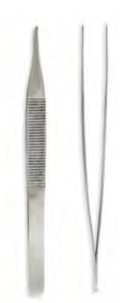
Adson 1X2T 4 3/4" Fine Point Qty/Case: 250