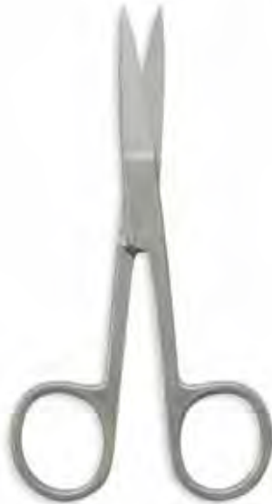
OR, Straight, 4 1/2", Sharp/Sharp Qty/Case: 250