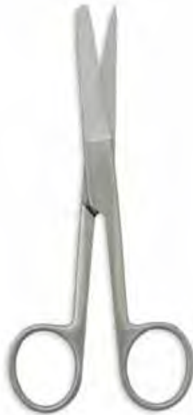
OR Straight, 5 1/2", Sharp/Blunt (Satin) Qty/Case: 250