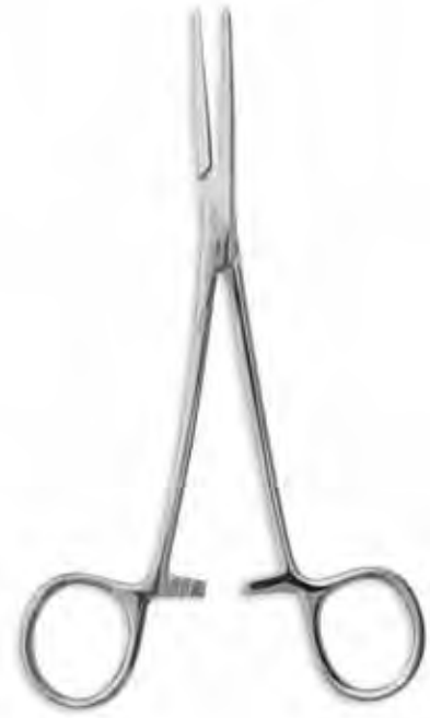
Rankin Crile, Straight, 6 1/4" Qty/Case: 250