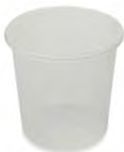
Medicine Cup 2 oz. 60cc Clear