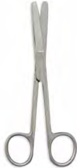
OR, Straight, 5 1/2", Blunt/Blunt Qty/Case: 250