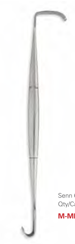
Senn 6 1/4" Sharp (FG) Qty/Case: 250 M-MR253