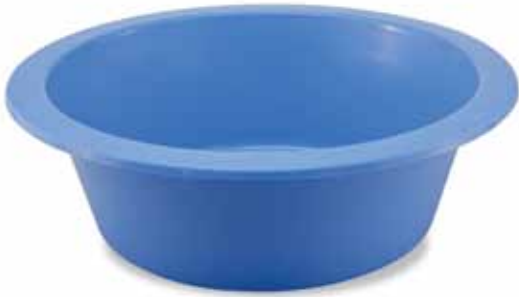
Ring Basin, 6000cc, 6qt (610OR)