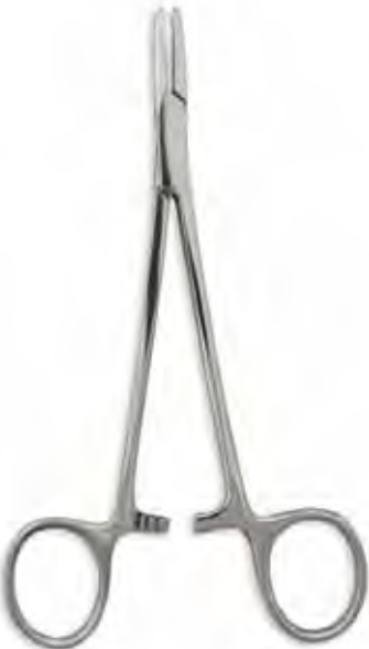
Mayo Hegar, 5 1/2" Qty/Case: 250