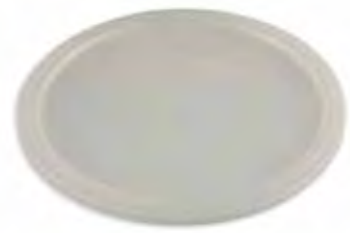
Lid, 80 oz Bowl 2500cc