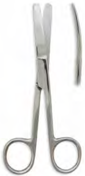
OR, Curved, 5 1/2", Blunt, Blunt Qty/Case: 250