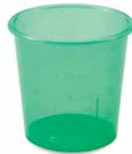
Medicine Cup 2 oz. 60cc Green