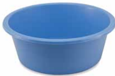
Utility Bowl 80 oz, 2500cc