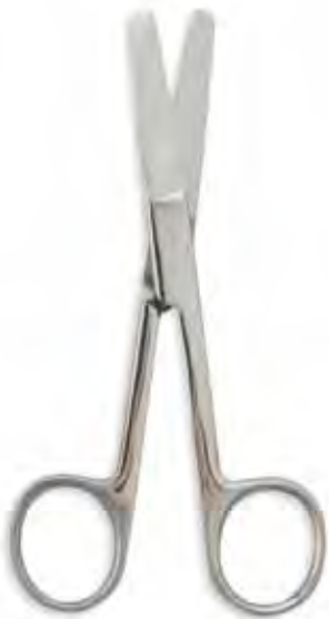
OR, Straight, 4 1/2", Blunt/Blunt Qty/Case: 250