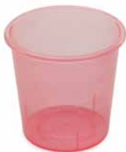
Medicine Cup 2 oz. 60cc Red