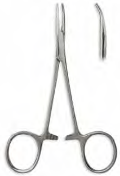
Mosquito, Curved, 5" Large/Ring Serr Qty/Case: 250