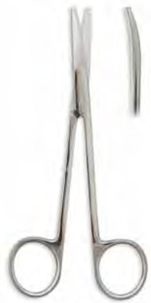
Metzenbaum, Curved, 5 1/2" Qty/Case: 125