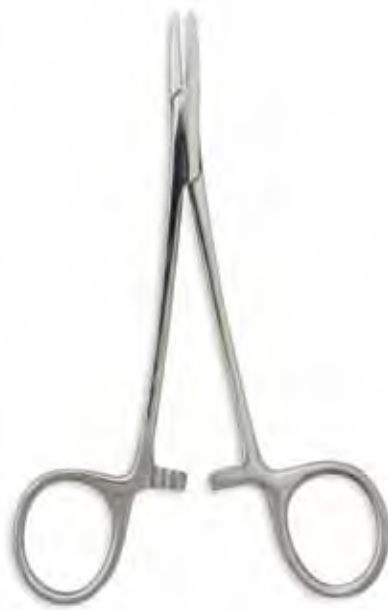
Baumgartner, 5 1/2" Large Ring Qty/Case: 250