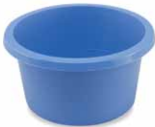
Solution Bowl 8 oz, 250cc