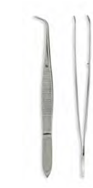
Eye Dressing, Full Curved Serrated Qty/Case: 500