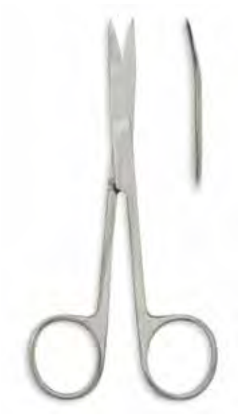
Iris, Curved, 4 1/2" Qty/Case: 250