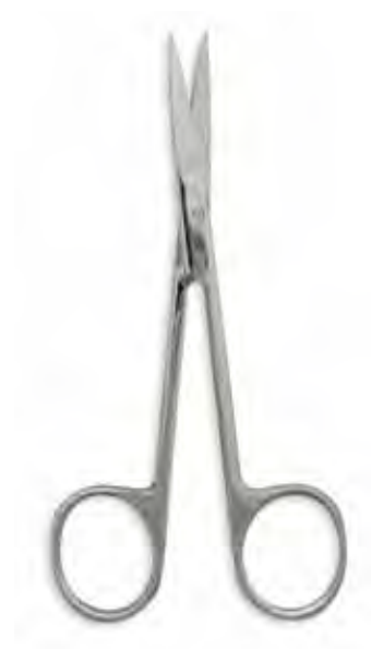
Iris, Straight, 4 1/2" Qty/Case: 250