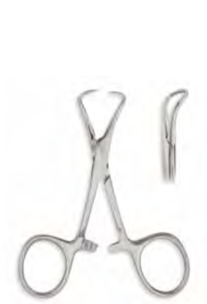
Backhaus Towel Clamp 3 1/2" Qty/Case: 200, Stainless Steel