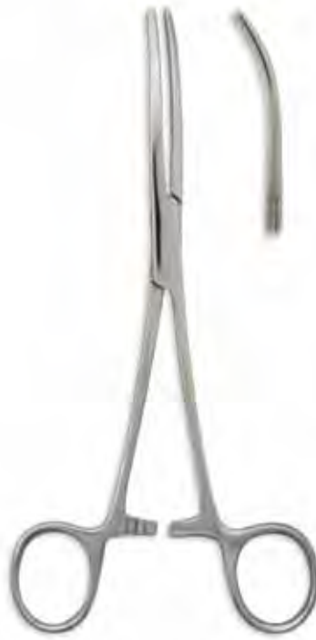
Rochester-Pean, Curved, 7 1/2" Qty/Case: 100