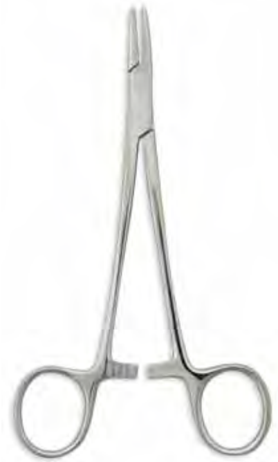
Baumgartner 6" Qty/Case: 250