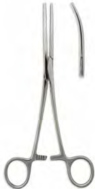
Rochester-Pean, Curved, 8" Qty/Case: 100