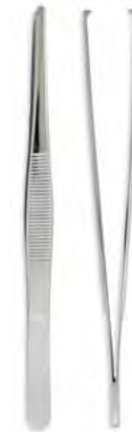
Tissue 6" 1X2 Qty/Case: 250