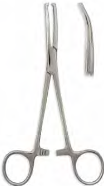
Rochester-Ochsner, Curved, 6 1/4" Qty/Case: 250