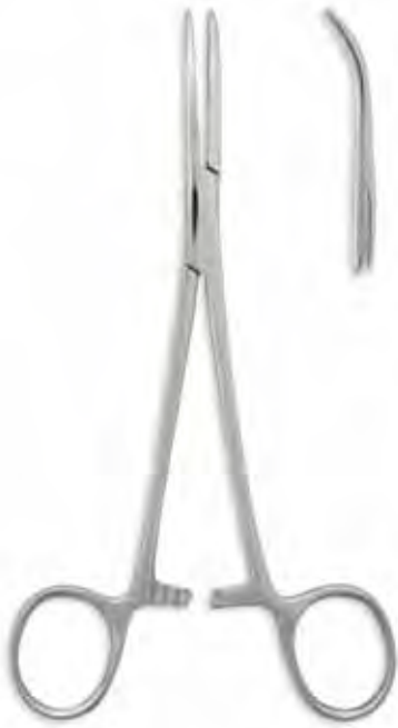
Kelly, Curved, 6 1/2" Qty/Case: 200