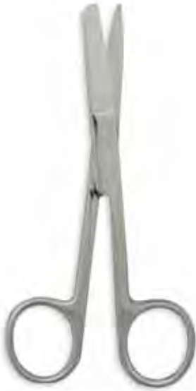
OR Straight, 4 1/2" Sharp/Blunt Qty/Case: 250