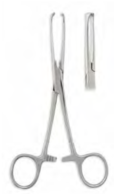
Allis Tissue, 4X5T, 6" Qty/Case: 200