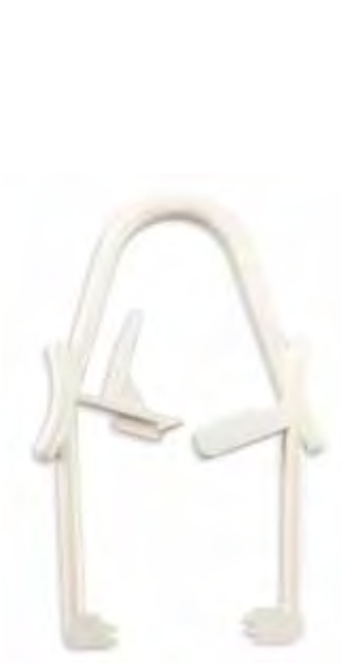
White Plastic Towel Clamp ABS