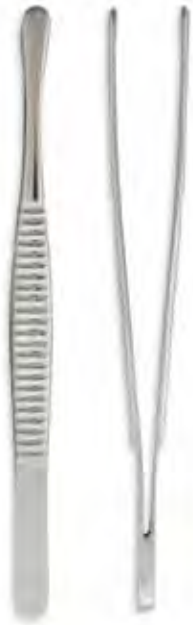
Russian Tissue 6" Qty/Case: 150