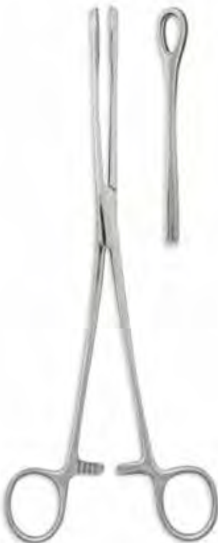
Sponge 9 1/2" Straight SERR. Qty/Case: 100