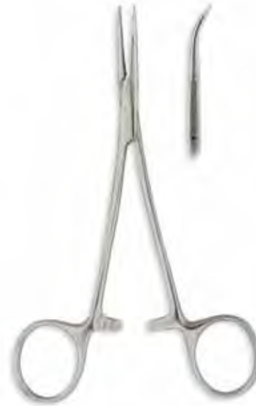
Mosquito, Curved FP 5" Qty/Case: 250