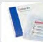
Custom Kits Page 141