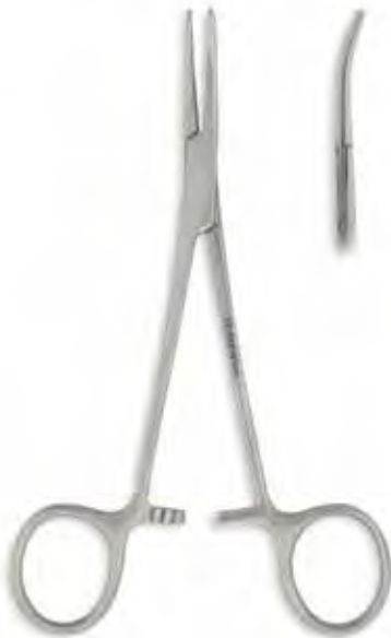
Mosquito Curved, 5" (Org-P) Satin Qty/Case: 150