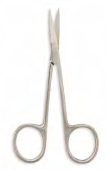
Iris Straight 4 1/2" (FG) Qty/Case: 250