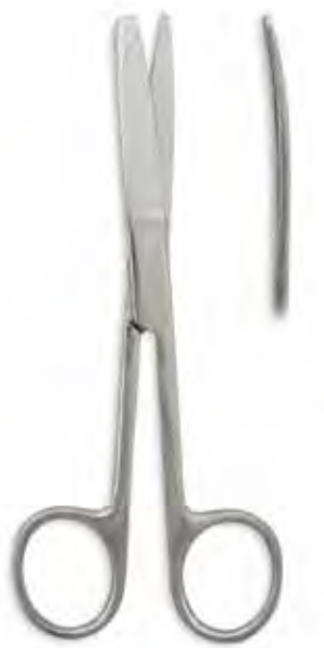
OR, Curved, 5 1/2", Sharp/Blunt Qty/Case: 250