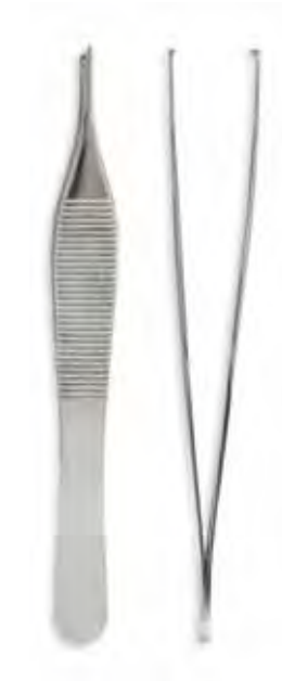
Adson 1X2T 4 3/4" Fine Point Qty/Case: 250