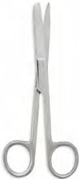
OR, Straight, 5 1/2", Sharp/Blunt Qty/Case: 250