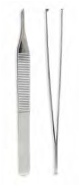
Adson 1X2T 4 3/4" Qty/Case: 250