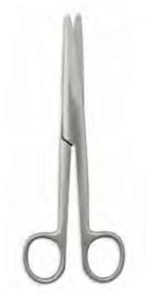
Mayo Noble, 6 1/2" Straight Qty/Case: 100