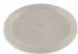
Lid, 16 oz Bowl 500cc