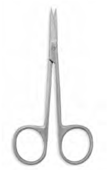
Iris, Straight, 4 1/2" Large Ring Qty/Case: 250