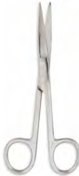
OR, Straight, 5 1/2", Sharp/Sharp Qty/Case: 250