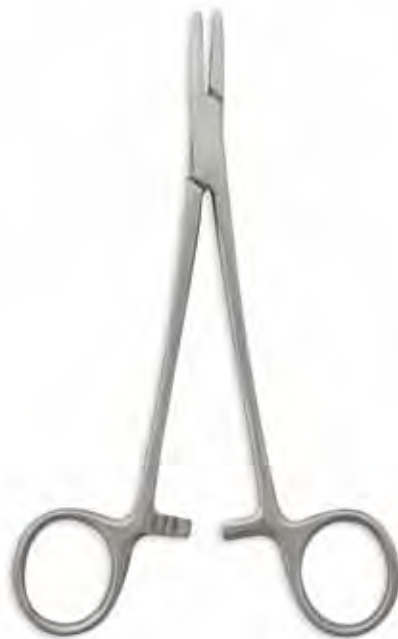
Mayo Hegar 6" TC ClassicPlus Qty/Case: 50