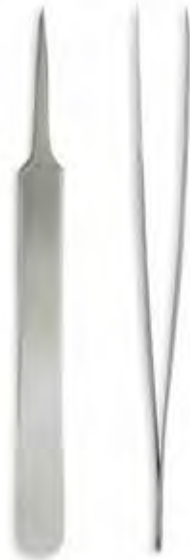
Smooth (O.R.G) 4 1/2" Qty/Case: 250