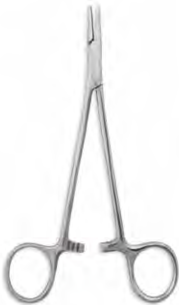
Baumgartner 5 1/2" Qty/Case: 250