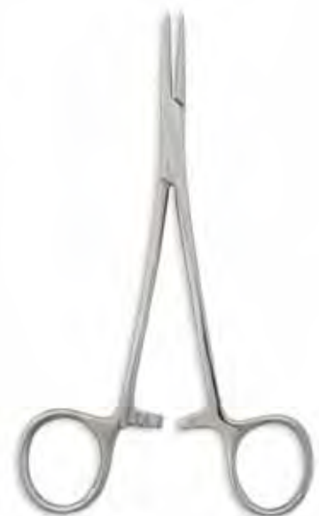
Mosquito, Straight, 5" Qty/Case: 250