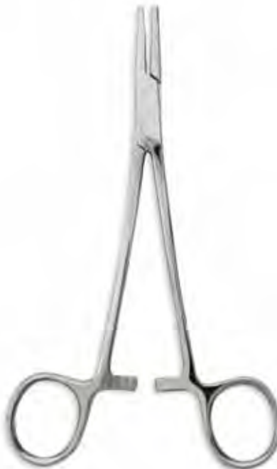
Mayo Hegar, 6" Qty/Case: 200