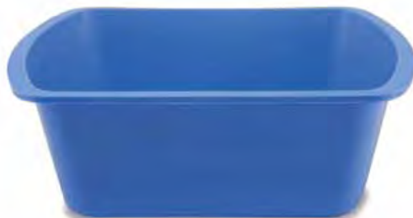
Rect Basin, 8qt (11x14x5)