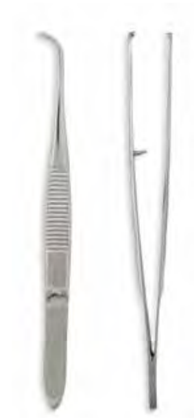
Adson Eye Dressing, Full Curve 1X2T Qty/Case: 500