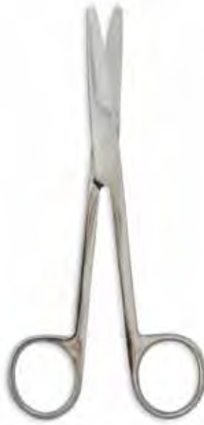
Mayo, Straight, 5 1/2" Qty/Case: 250