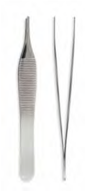
Adson Serrated 4 3/4" (FG) Qty/Case: 250