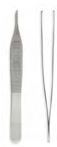
Adson Serrated 4 3/4" 1X2T Qty/Case: 250