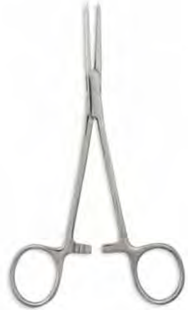
Kelly, Straight, 5 1/2" Qty/Case: 250