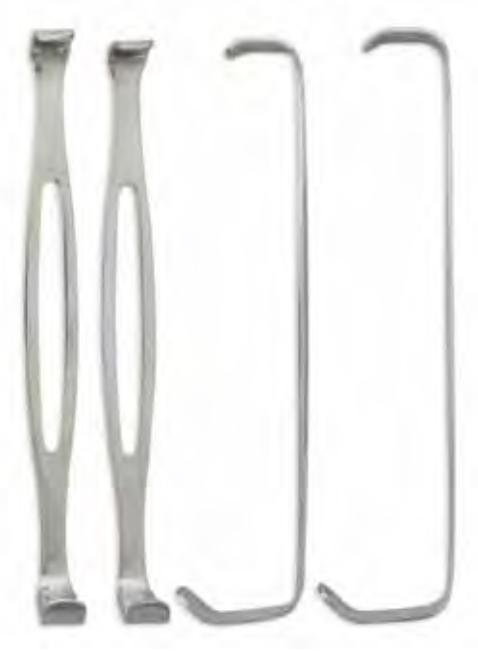
U.S. Army 8 1/2" Qty/Case: 100 M-MR054