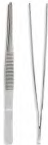
Thumb Dressing, Serrated 5" Qty/Case: 250