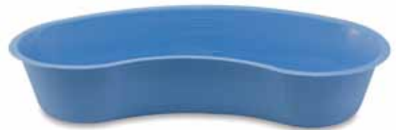
Emesis Basin 700cc (607OR)