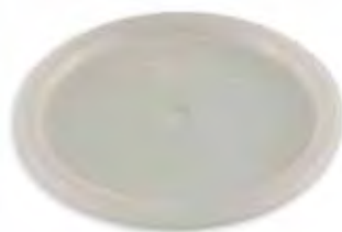
Lid, 32 oz Bowl 1000cc