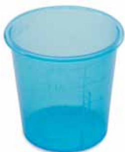
Medicine Cup 2 oz. 60cc Blue