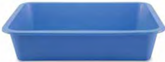
Placenta Basin with out Lid, 3000cc