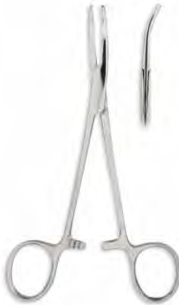
Kelly, Curved, 5 1/2" Qty/Case: 250