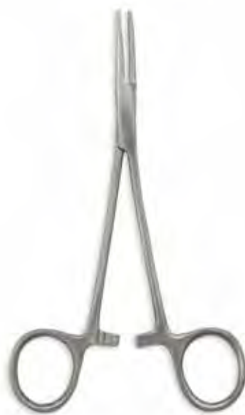
Mosquito, Straight 5" (Satin) Qty/Case: 250