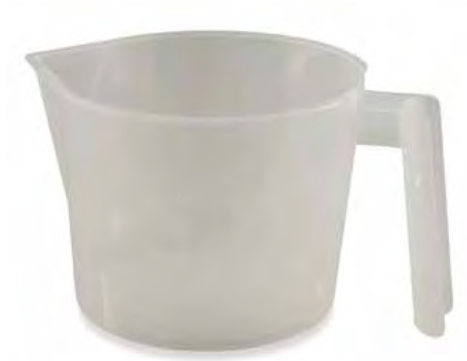
1200cc Pitcher with Handle (611OR)