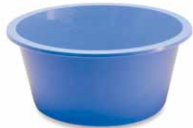
Utility Bowl 32 oz, 1000cc