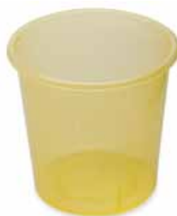
Medicine Cup 2 oz. 60cc Yellow