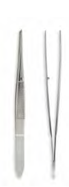
Iris Straight, Serrated 4" Qty/Case: 100