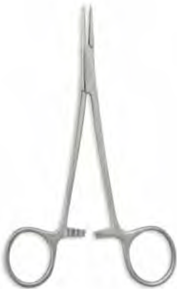
Halsey 5" Qty/Case: 250