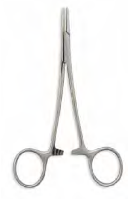
Webster 5" Qty/Case: 250