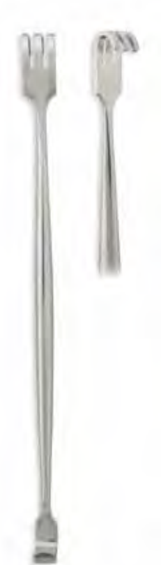
Senn 6 1/4" Blunt Qty/Case: 180 M-MR052