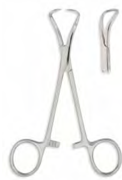
Backhaus Towel Clamp 5 1/4" Qty/Case: 250, Stainless Steel