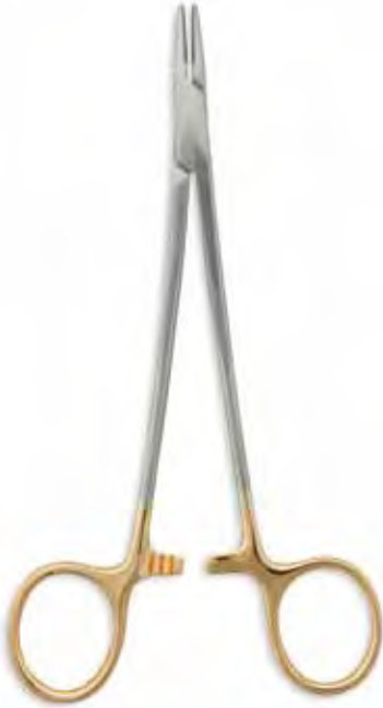
Mayo Hegar 6" TC ClassicPlus Qty/Case: 50