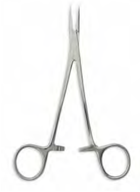
Webster 5" Fine Point Qty/Case: 250