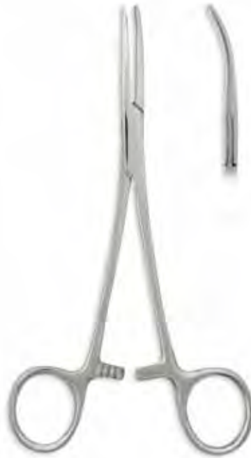
Rankin Crile, Curved, 6 1/4" Qty/Case: 250