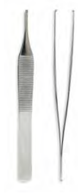
Adson 4 3/4" 1X2T Micro Tip Qty/Case: 250