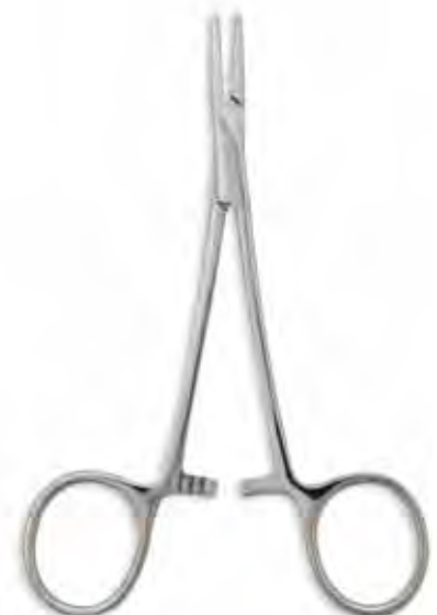
Mosq Webster 5", Lg/Ring SERTD Qty/Case: 250