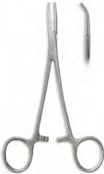
Mosquito, Curved FP 5" Qty/Case: 250