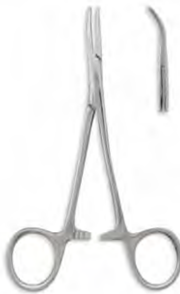
Mosquito, Curved 5" Qty/Case: 250