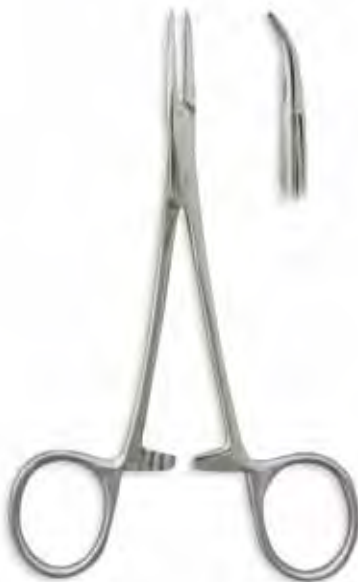
Mosquito, Curved, 5" Micro Qty/Case: 250