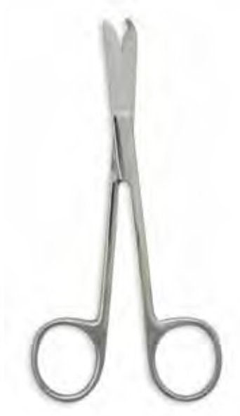
Littauer, 4 1/2" Qty/Case: 250