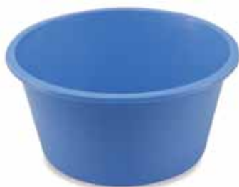
Utility Bowl 48 oz, 1500cc