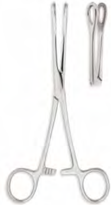
Sponge 7" Straight, SERR. Qty/Case: 100