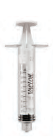
VacLok 10ml Negative Pressure White