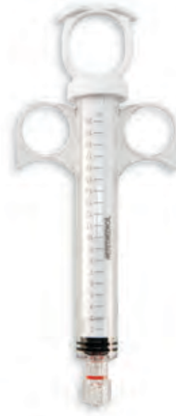
20ml, Solid Plunger