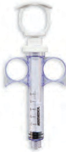
6ml, Locking Ring Plunger Fixed Male Adapter

Plunger Material: ABS Material: Polycarbonate Tip Material: Silicone