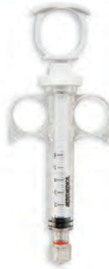
6ml, Locking Ring Plunger Rotating Male Adapter