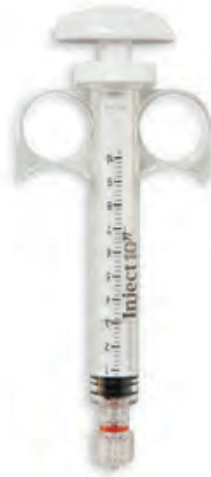
10ml, Inject10n, Solid Plunger