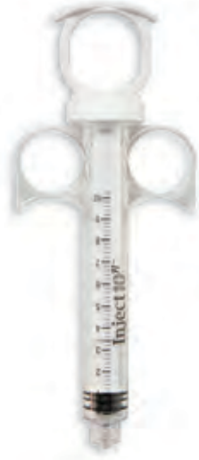
10ml, Inject10n, Solid Plunger CCX011P