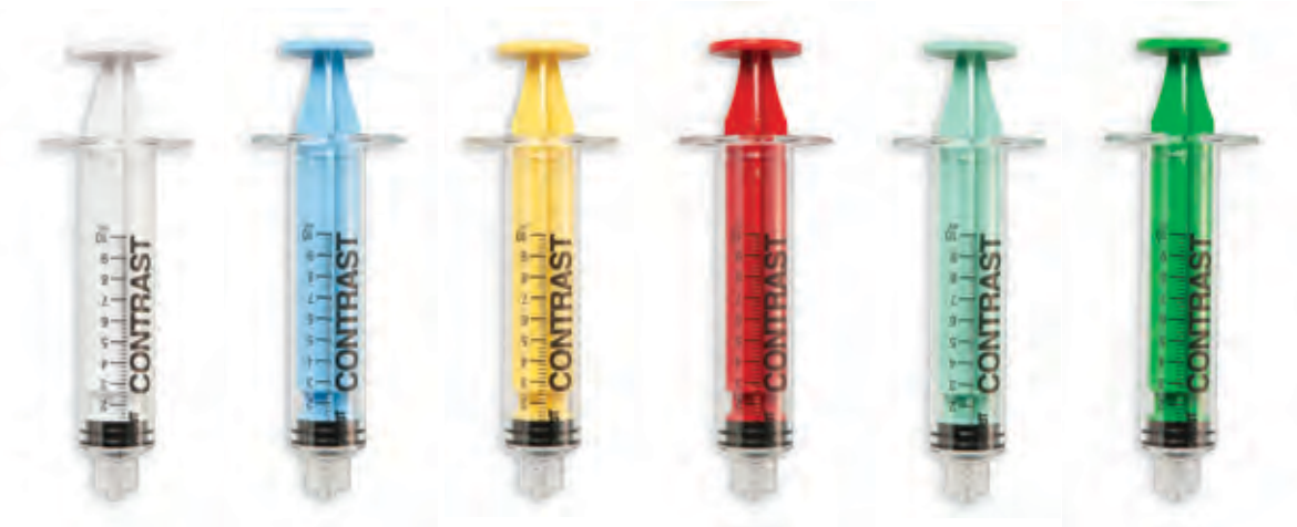
White Light Blue Yellow Red Light Green Dark Green K01-60078P K01-60086P K01-60102P K01-60110P K01-60094P K01-00786P

Barrel Material: Polycarbonate Tip Material: Silicone Plunger Material: ABS