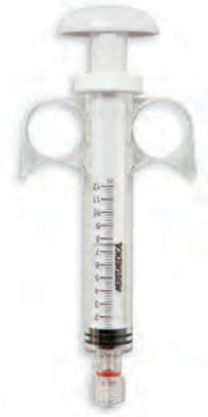
12ml, Solid Plunger