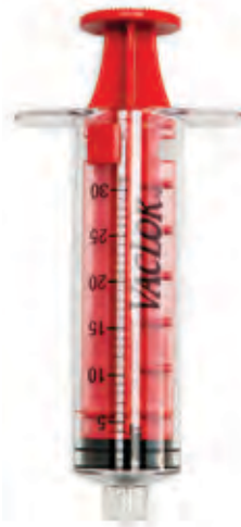
VacLok 30ml Negative Pressure Red