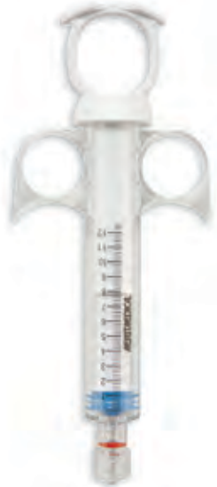
12ml, Smart Tip, Solid Plunger