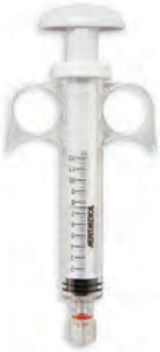
8ml, Inject8, Solid Plunger