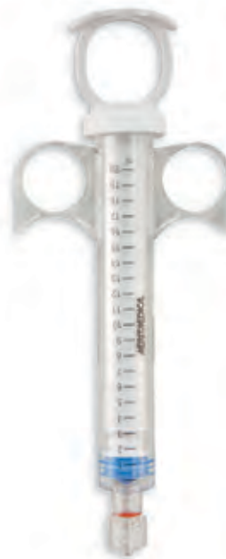
20ml, Smart Tip, Solid Plunger