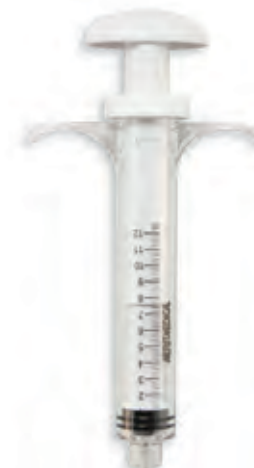
12ml, Solid Plunger CCSB711P