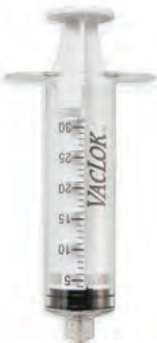
VacLok 30ml Negative Pressure White