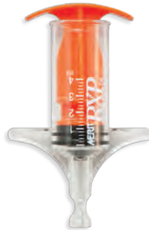
4ml, Rapid Exchange Prep Syringe RXPORP