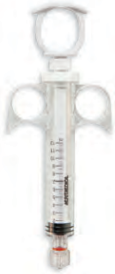
12ml, Solid Plunger