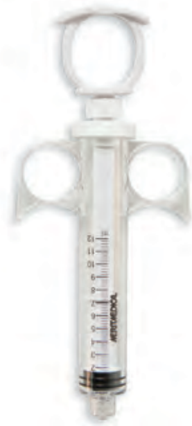
12ml, Locking Ring Plunger Fixed Male Adapter