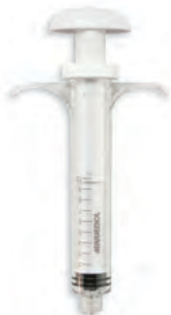
10ml, Solid Plunger CCSB911P