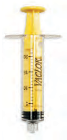
VacLok 20ml Negative Pressure Yellow