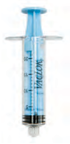
VacLok 20ml Negative Pressure Light Blue