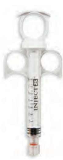
8ml, Inject8™, Solid Plunger