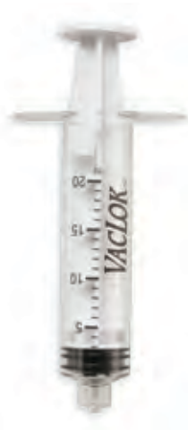
VacLok 20ml Negative Pressure White