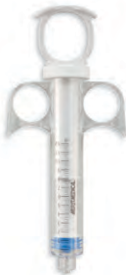
12ml, Smart Tip, Solid Plunger