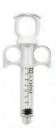
8ml, Inject8, Solid Plunger CCS881P

Plunger Material: ABS Material: Polycarbonate Tip Material: Silicone