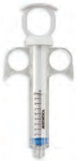
10ml, Smart Tip, Solid Plunger