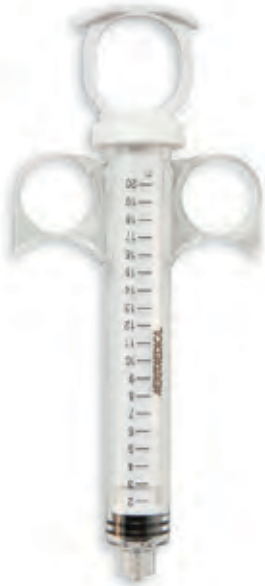
20ml, Solid Plunger CCS321P