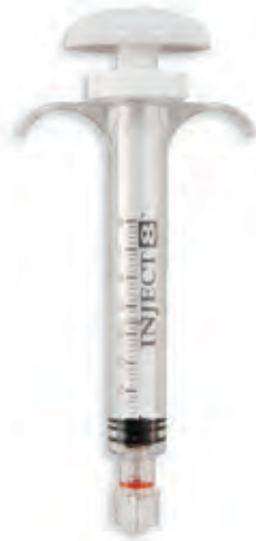
8ml, Inject8, Solid Plunger CCSW880P

Plunger Material: ABS Material: Polycarbonate Tip Material: Silicone