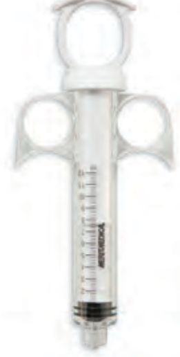
12ml, Solid Plunger CCS601P