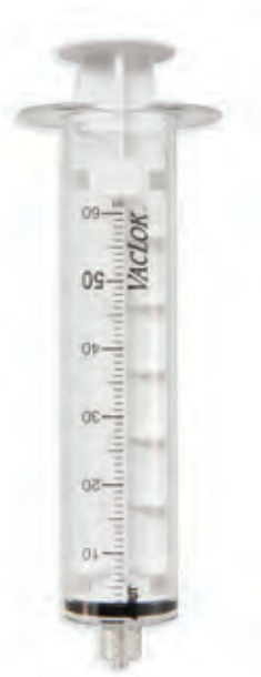
VacLok 60ml Negative Pressure White