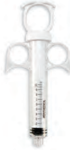
10ml, Solid Plunger CCS801P