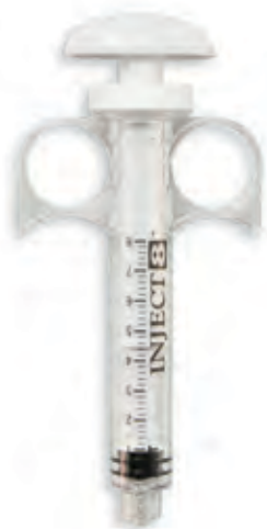
8ml, Inject8, Solid Plunger