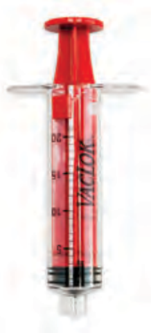
VacLok 20ml Negative Pressure Red