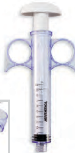
10ml, Open Bore K06-00189P