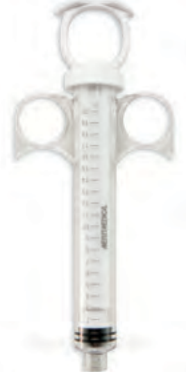
20ml, Open Bore K06-00281P