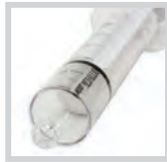
60ml, Toomey tip MSS160TP