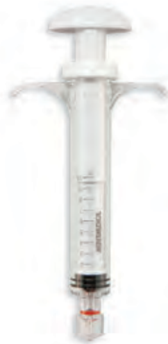
10ml, Solid Plunger CCSB910P