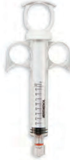
10ml, Solid Plunger