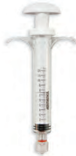
12ml, Solid Plunger CCSB710P