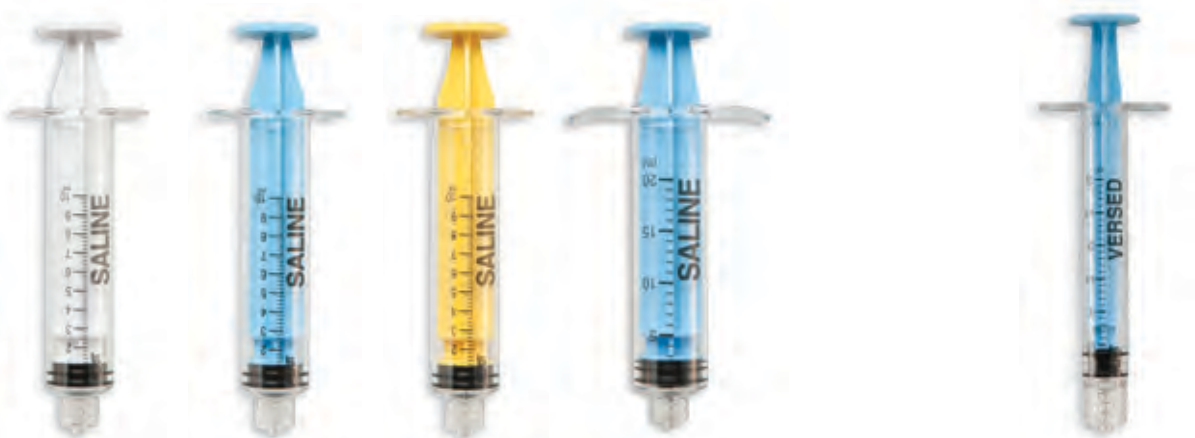
White, 10ml Light Blue, 10ml Yellow, 10ml Light Blue, 20ml, sword handle Light Blue K01-60075P K01-60083P K01-60099P K01-6099P K01-05185P

Barrel Material: Polycarbonate Tip Material: Silicone Plunger Material: ABS