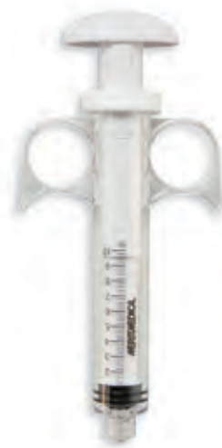
10ml, Solid Plunger