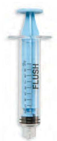
Light Blue K01-05093P

Barrel Material: Polycarbonate Tip Material: Silicone Plunger Material: ABS