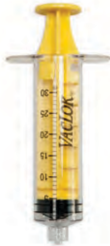
VacLok 30ml Negative Pressure Yellow