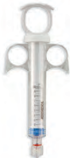
10ml, Smart Tip, Solid Plunger