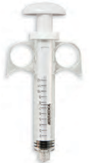
12ml, Solid Plunger