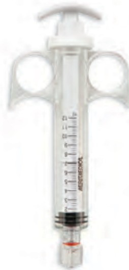
12ml, Locking Ring Plunger Rotating Male Adapter