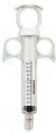
12ml, Solid Plunger