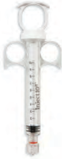
10ml, Inject10n™, Solid Plunger