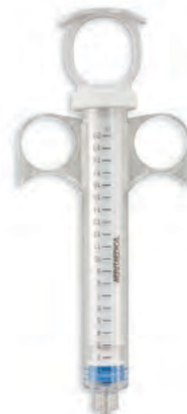
20ml, Smart Tip, Solid Plunger