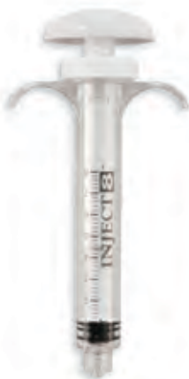
8ml, Inject8, Solid Plunger CCSW881P

Plunger Material: ABS Material: Polycarbonate Tip Material: Silicone