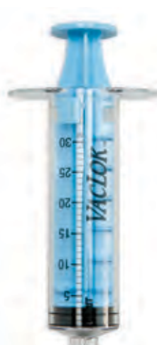
VacLok 30ml Negative Pressure Light Blue