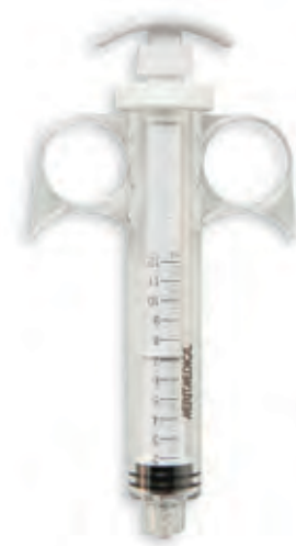
12ml, Locking Ring Plunger Fixed Male Adapter