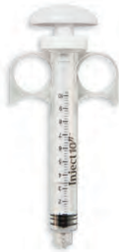
10ml, Inject10n, Solid Plunger