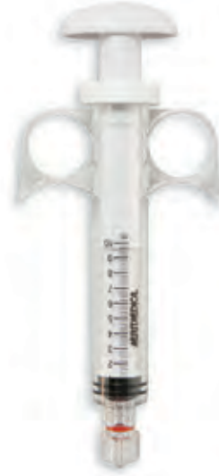
10ml, Solid Plunger