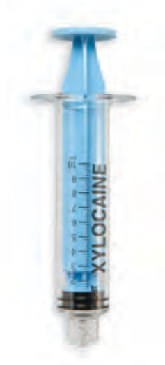
Light Blue K01-00917P

Barrel Material: Polycarbonate Tip Material: Silicone Plunger Material: ABS